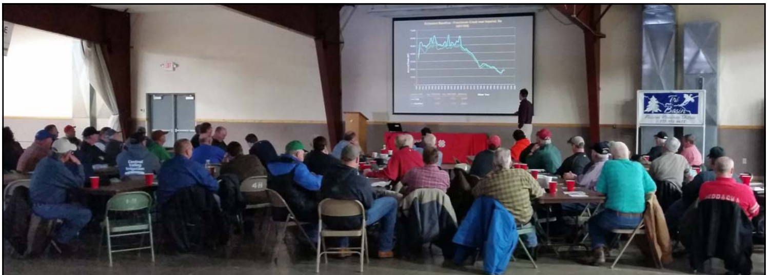
Attendees listen to a presentation at the 2015 Holdrege Water Conference

"Dedicated to Conservation of our Natural Resources"