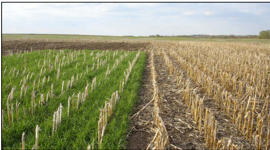
Cover crops benefit crop production by preventing erosion, preventing weeds, and increasing soil biology.

There is so much more we have to learn but I challenge you to consider how cover crops can help you protect your soil, reduce your weed pressure and increase your soil biology.