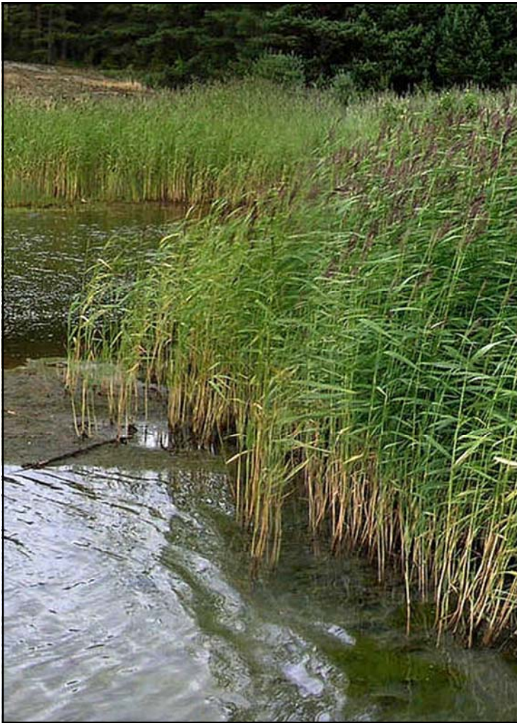
Phragmites is an invasive species in Nebraska. Because it crowds out native plants and alters wildlife habitat, it has been put on the Nebraska Noxious Weed List. For a full list of Nebraska's noxious weeds, visit http://www.neweed.org/Weeds.aspx .

There are abundant examples of invasive species that have become established in south-central Nebraska. Some have become so common that we think of them as natives. House sparrows, rock doves (pigeons) and starlings are examples of non-native birds. German carp, Norway rats, Siberian (Chinese) elms, are all immigrants from other lands, as their names imply. A list of invasive and non-native insects and plants would run several pages.