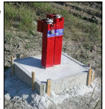
A completed dedicated observation well.

The dedicated observation wells are part of a district-wide network of irrigation wells and observation wells in which groundwater levels are monitored in order to protect the district's groundwater supply. Tri-Basin has installed at least one dedicated observation well in every township in the district. Data loggers in the observation wells automatically measure water levels at regular intervals, which helps