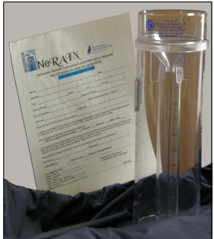
NeRAIN volunteers are provided a rain gauge (above) and training on reporting precipitation received on their property.

ord rain gauge readings at their home, farm, or place of business. District staff hope to eventually recruit at least one volunteer from each of Tri-Basin's 45 townships to record and transmit rainfall and snowfall data.