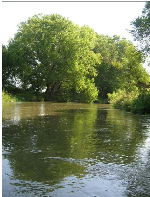
The Republican River, 2012.

That is equal to about 25 percent of Nebraska's alleged overuse in 2005 and 2006, the years for which Nebraska was sued by Kansas. Had the accounting change been in place in 2013, for example, Nebraska would have had to take little or no action to stay in compliance and in 2014 it would have substantially reduced the amount of water pumped by NRD augmentation projects.