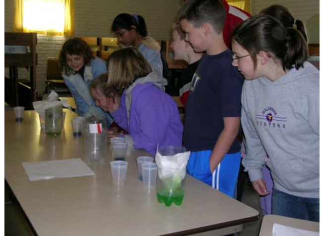
Students build a water filter.

Weed control should also be considered when planting new trees. Controlling weeds is most critical in a four-foot circumference of the tree where the roots will be growing. Herbicides, mowing, and mulches are all successful means to remove and keep weeds away. The use of conservation mulches is an excellent method for conserving soil moisture while eliminating most weed competition.